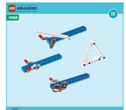
Principle Models Building Instructions booklet for levers and gears